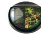
Display lid for serving station